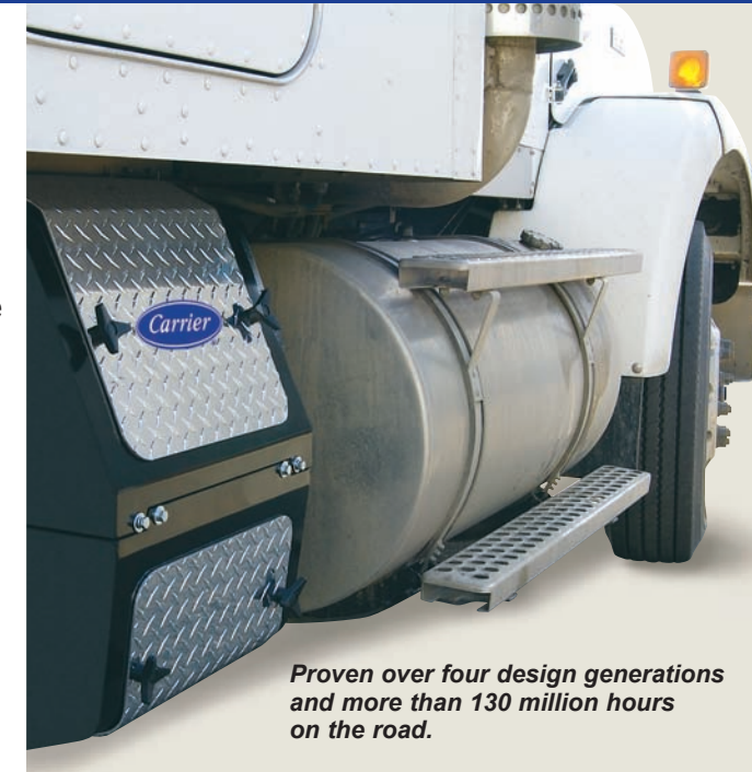
Proven over four design generations and more than 130 million hours on the road.