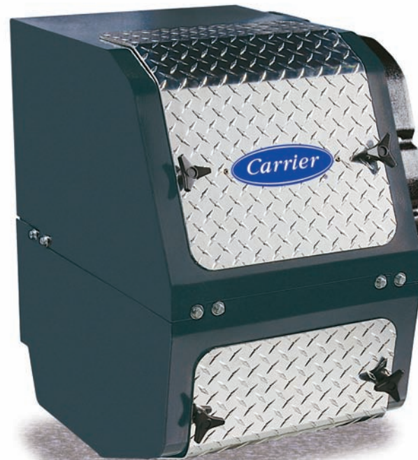
Self-contained full-function auxiliary power in a shock-resistant chassis-mount design.