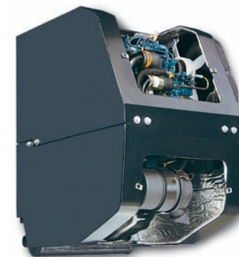
Weather-tight removable panels provide immediate access to serviceable components.