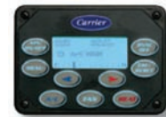
Multi-function Control Panel

Externally mounted on the side rails, the Carrier APU is protected in its own weatherproof compartment and runs off the truck's fuel supply. This innovative hybrid diesel-electric system saves fuel, runs quieter than the truck engine, reduces emissions, and provides reliable all-night comfort for the driver.