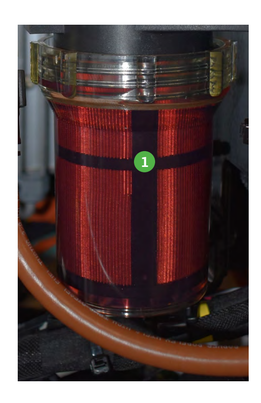
1 NEW: Enhanced Fuel Filtration that supports common-rail fuel injection.