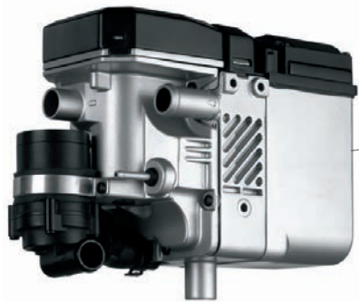
Thermo Top C Coolant Heater with SmarTemp fx 2.0 Control